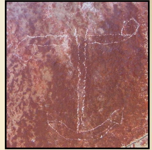
Petroglyphs of a Masted Vessel and Anchor representing “Early Contact” At Point Conception

Albert Knight pointed out additional “Early Contact” petroglyphs at Point Conception, just 30 miles north of the Channel Islands. Incised into the red pigment of a Chumash rock shelter.