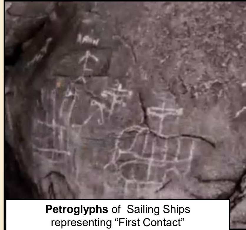
Petroglyphs of Sailing Ships representing “First Contact” in the Jacumba National Wilderness (70 miles east of San Diego)